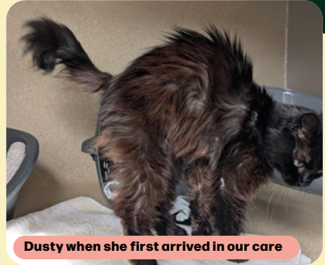
Dusty when she first arrived in our care

Dusty had a long road to recovery. She'd been fighting for her life for so long that it took her a while to relax into the safety of her cat pen. She hid away inside her carrier for the first few days and would hiss when anyone came too close.